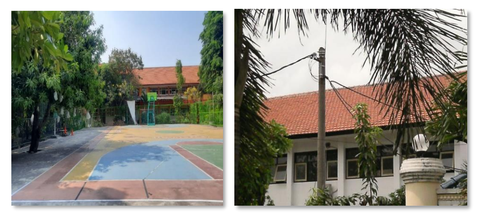
Figure 2. The Location of SMAN 20 has the Potential for Installing a Solar Power Plant.

Therefore, the purpose of community service activities at SMAN 20 Surabaya is to socialize the utilization of solar power plant through solar power plant learning (education) activities and training for students and school teachers. Activities are carried out with counseling, demonstrations or practice using solar power plants components, and solar power plants planning at SMAN 20 Surabaya (Figure 2).