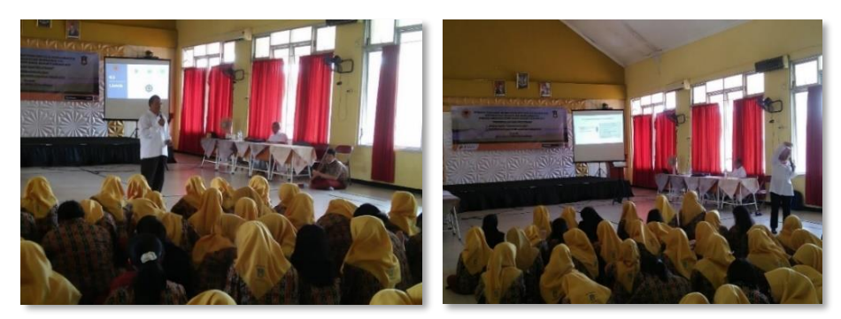
Figure 4. Submission of Material in Classroom

At the implementation stage, lectures were held in the classroom which were attended by all teachers and students of SMAN 20 Surabaya. In this stage an understanding of the conversion process from solar radiation to DC electricity using solar panels is given. In addition, an explanation of other components used in solar power plant is given. Explanation of the material in class is shown in Figure 4.