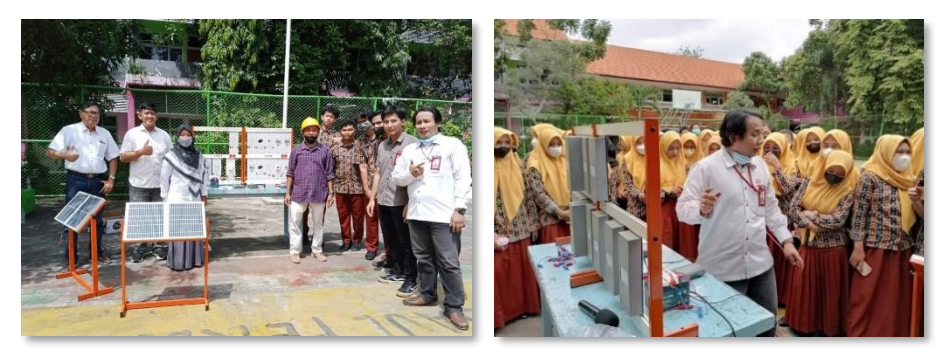
Figure 6. Practice Activities with Students

The electricity converted by the inverter has been turned into alternating current electricity which can later be used to power electronic devices such as AC lights, water pumps, etc. The use of batteries / accumulators as a storage of electrical energy can run even in the afternoon, at night, or during rainy conditions. The solar power plants work scheme with its electronic components is shown in Figure 5. To show solar power plants works, practice is carried out directly outside the classroom. In this demonstration activity, a 50 WP solar panel, a 30 Ah battery, a 1 kW inverter, a 10 A solar charge control, and a 20 W lamp load were used. This hands-on practical activity with students is shown in Figure 6.