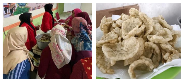
Figure 3. The Enthusiasm in Making Kerupuk Kelor

Figure 3 explains the enthusiasm of village residents in producing Kerupuk Kelor . The output of this activity is Kerupuk Kelor with a crunchy texture, delicious taste and preserved nutrition. Assistance in making Kerupuk Kelor has resulted in a new innovative product that is able to compete with existing products. These Kerupuk Kelor also have two sales versions in the form of raw products and ready-to-eat products. Kerupuk kelor products can also be an addition to BUMDes from Balongmojo Village. This innovation not only improves product quality, but also provides added value and higher competitiveness.