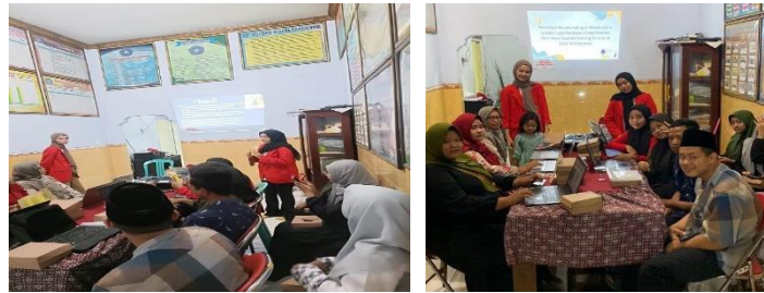
Figure 1. Assistance in Creating Attractive Packaging Designs for the Village Community

then washed clean and dried naturally or with the help of sunlight. After drying, the Kelor leaves will be ground into powder or made into thin pieces. After that, the powder or pieces of Kelor leaves are processed together with cracker dough which generally consists of tapioca flour, water, salt and other additional ingredients. The dough is then processed and molded into the desired cracker shape, such as circular crackers or thin crackers. Then, the Kerupuk Kelor are dried in the sun again until they are completely dry. Once dry, the crackers are ready to be fried and baked before consumption. Kerupuk Kelor have a distinctive and crunchy taste and have nutritional benefits from the Kelor leaves themselves.