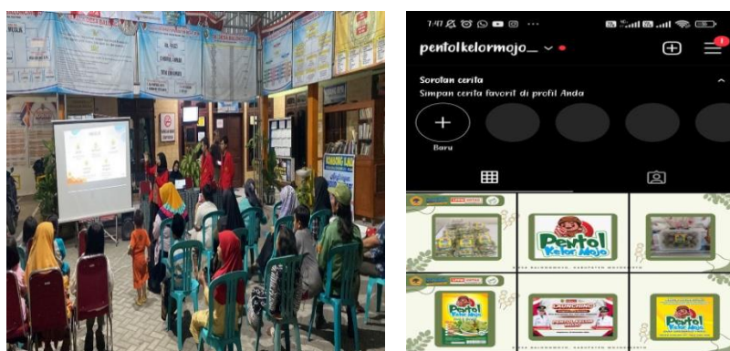
Figure 5. Creating Social Media as a Marketing Medium for Original Products from Balongmojo

Figure 4 shows the activity of using sugar cane waste as a hydroponic medium so that it can reduce agricultural waste and help reduce negative impacts on the environment. Apart from that, seen from many aspects, sugar cane waste can be an item of selling value, for example in the aspect of local economic development this activity can also provide new economic opportunities for the people of Balongmojo Village. By utilizing sugar cane waste as a hydroponic medium, people can be involved in the production and sale of hydroponic plants. This can help increase income and local economic development. In facing this problem, a solution has been found, namely changing sugarcane waste into a hydroponic planting medium, which can help minimize operational costs in hydroponic vegetable cultivation.