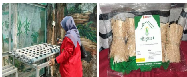
Figure 4. Utilization of Sugarcane Bagasse as a Hydroponic Growing Medium

Figure 4 shows the activity of using sugar cane waste as a hydroponic medium so that it can reduce agricultural waste and help reduce negative impacts on the environment. Apart from that, seen from many aspects, sugar cane waste can be an item of selling value, for example in the aspect of local economic development this activity can also provide new economic opportunities for the people of Balongmojo Village. By utilizing sugar cane waste as a hydroponic medium, people can be involved in the production and sale of hydroponic plants. This can help increase income and local economic development. In facing this problem, a solution has been found, namely changing sugarcane waste into a hydroponic planting medium, which can help minimize operational costs in hydroponic vegetable cultivation.